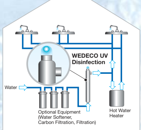
Typical WEDECO UV Installation

For states that require NSF Standard-55 Class A certification, or just for homeowners who want the top of the line in performance and safety, Model M units feature a highly accurate, UV specific (at the critical 254 nm wavelength) lamp output monitor. This device continously monitors the ultraviolet intensity reaching the disinfection chamber wall (the furthest point from the UV lamp). As a result, it automatically reacts to changes in UV intensity within the unit, which may be caused by normal lamp aging, abnormal quartz sleeve fouling or water quality changes. This provides a second level of protection for the homeowner. Not only is the homeowner sure that the unit is operating effectively, they are also sure that it is always delivering the right dose for protection.