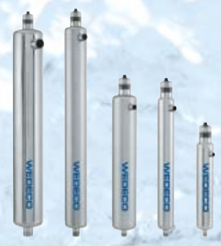
40 GPM 30 GPM 18 GPM 10 GPM 4 GPM

WEDECO customer service staff are just a phone call or email away for all of your parts or equipment needs. They can answer any technical questions regarding a product feature, service, or installation. In most cases, WEDECO is able to ship equipment and parts the same day you place an order, and will deliver the items on a rush basis if needed.