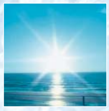
UV is a Component of Sunlight